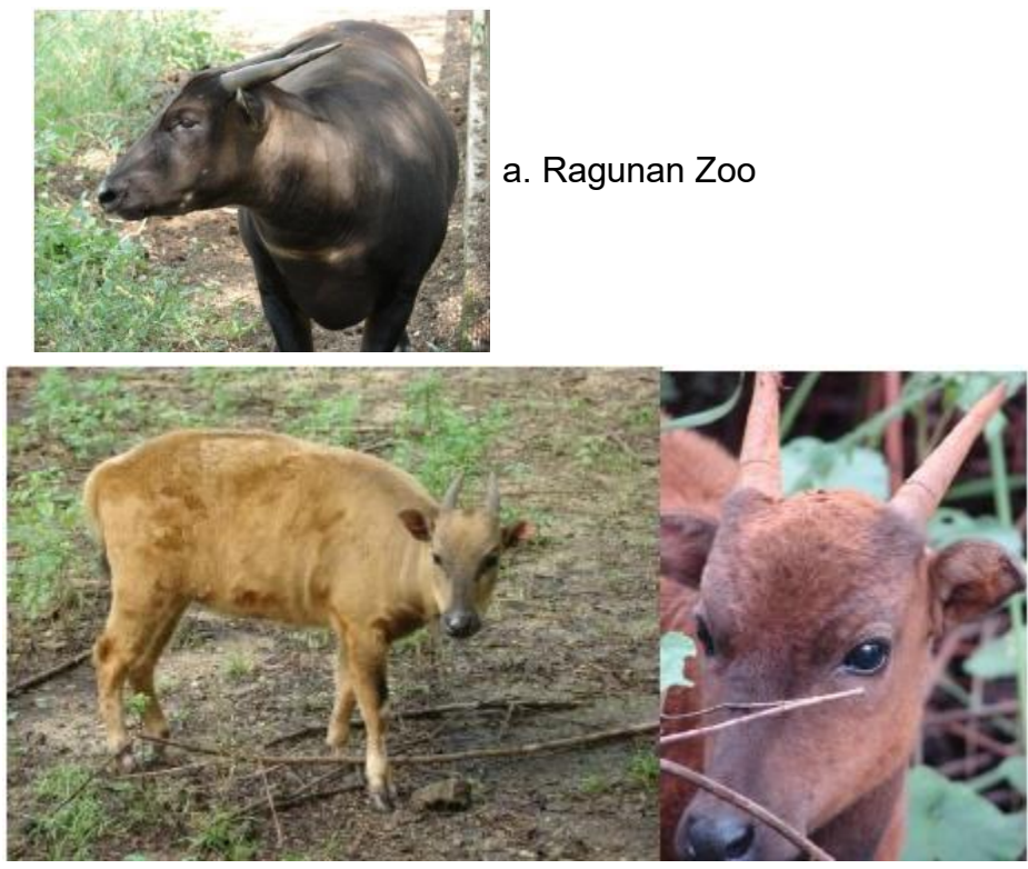
b. Palu c. Luwu Timur Image 1. Variation in anoa morphology

Knowledge of the taxonomy and population structure of anoa are required to conserve their populations and habitat. However, both of these remain uncertain (Groves 1969; Honacki et.al., 1982; Wilson & Reeder 1993, Sugiri & Hidayat 1996.Shreiber et.al., 1999 and Burton et.al., in prep.). The anoa taxonomy currently used was originally proposed by Groves (1969) and recognizes two species of anoa, namely the lowland anoa ( Bubalus depressicornis ) and the mountain anoa ( Bubalus quarlesi ). There are variations in anoa morphology between different regions in Sulawesi as can be seen in Image 1.